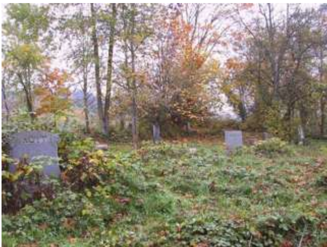
Hoyt gravestone in the Saar Cemetery: above as seen in 2004, before work began. To the right the same stone as seen in 2009.